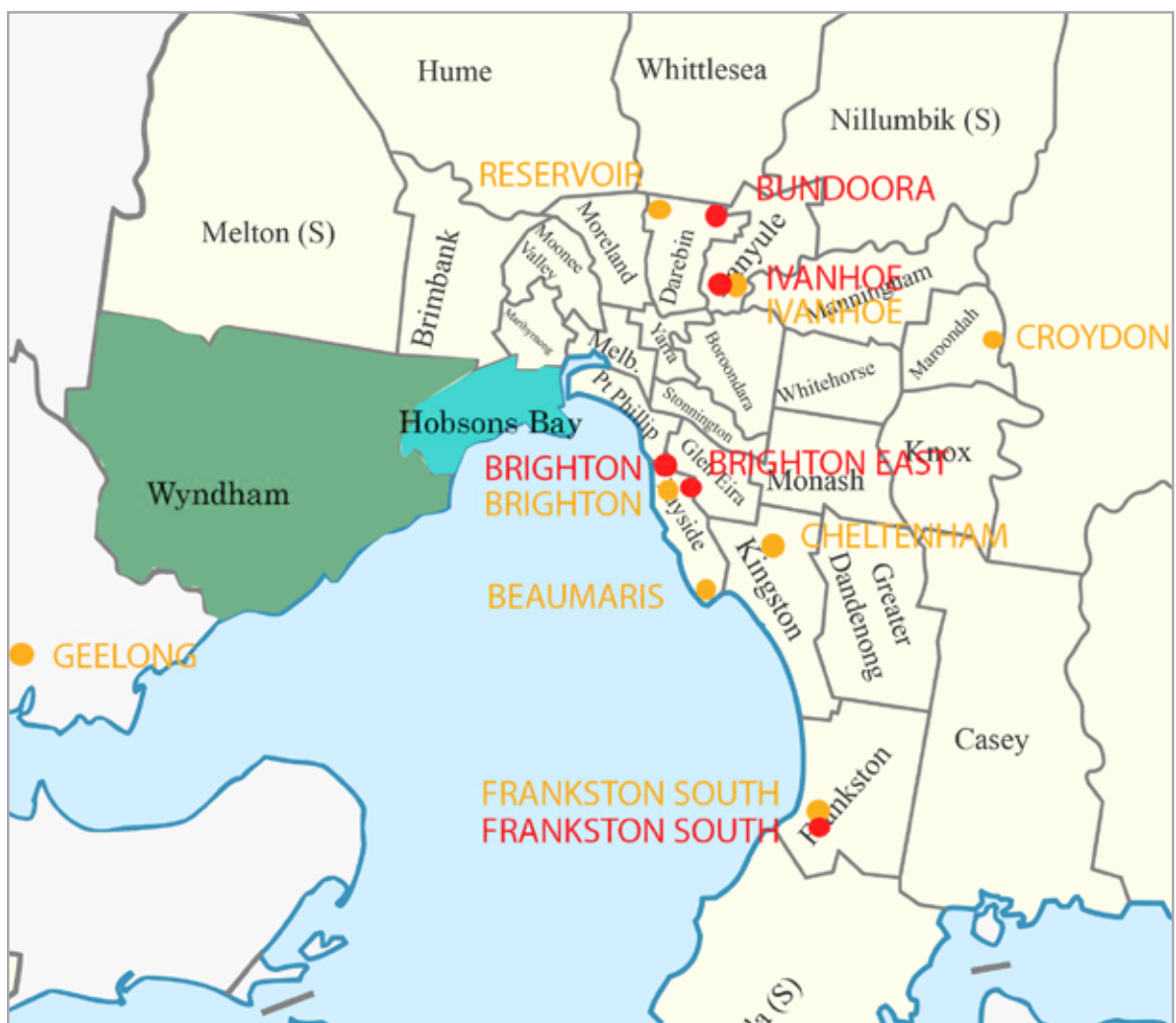
Illustration 1: Metropolitan Melbourne, showing Vasey RSL Care sites, highlighting Wyndham and Hobsons Bay Council regions in Melbourne's south-west with high populations of ex-service people.

DVA data indicate significant veteran populations with no matching specialist ex-service accommodation providers in the city's south-west: neighbouring municipalities of Wyndham and Hobsons Bay have some of Melbourne's highest concentrations of veterans with a combined 2514 ex-service people living across the two councils. This includes 592 veterans and war widows over 85 years, 966 veterans and war widows aged 65-85 and 956 who are under 65 years.