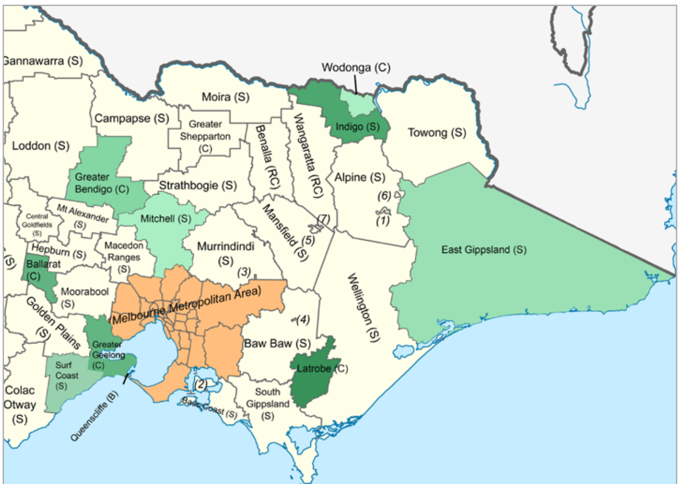
Illustration 2: Regional Melbourne, green highlighting indicating those council regions with higher veteran populations.

Map by Australia_Victoria_location_map.svg; NordNordWestderivative work: Cassowary (talk) - Australia_Victoria_location_map.svg, CC BY-SA 3.0, https://commons.wikimedia.org/w/index.php?curid=14530096 .