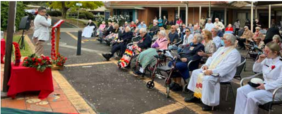
Vasey RSL Care Frankston South