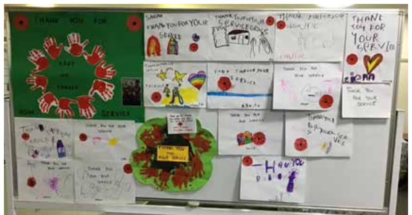
Vasey RSL Care Bundoora: messages of thanks and support from the children at Busy Bees Kindergarten.