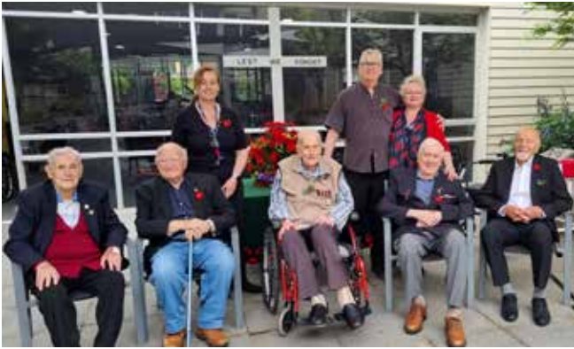
Vasey RSL Care Brighton East

This is one of the most important days of the year for our community and it was commemorated at all of our aged care homes with solemn services of remembrance.